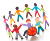
Norfolk Local Offer

There may be times when parents, carers and young people are not happy with the decision and level of support offered and provided.